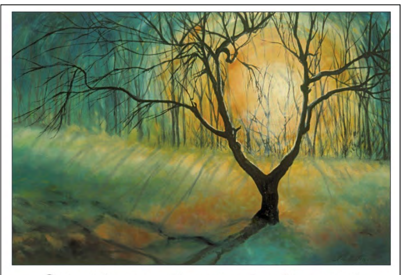
Divine wisdom, peace and love are part of your being, your soul.

"We are knee-deep in a river, searching for water," writes Kabir Helminski, a contemporary Wisdom teacher in the Sufi lineage, using a vivid image to capture the irony of our contemporary plight. The sacred road maps of wholeness still exist in the cosmos...But to read the clues it is first necessary to bring the heart and mind and body into